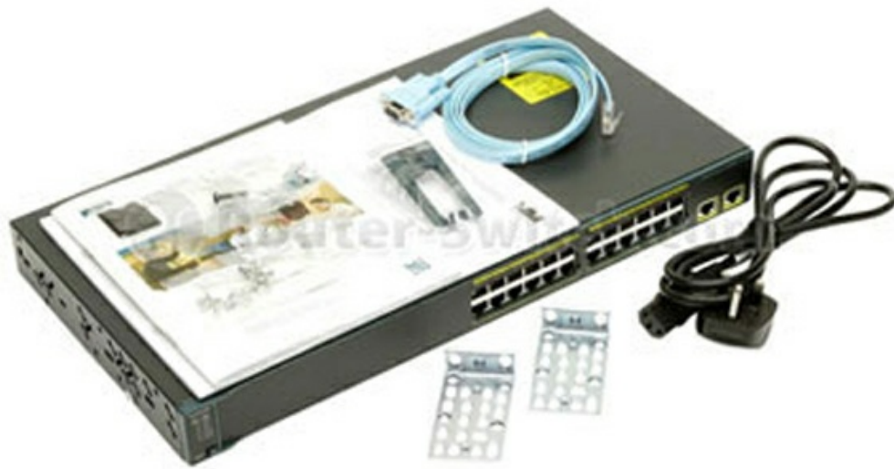
Table 1 shows the Quick Spec of the Cisco 2960-24TT-L switch.

Figure 1 shows the appearance of the Cisco WS-C2960-24TT-L switch and its accessories.