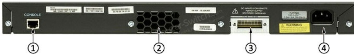
Figure 3 shows the back panel of the Cisco 2960-24TT-L switch.